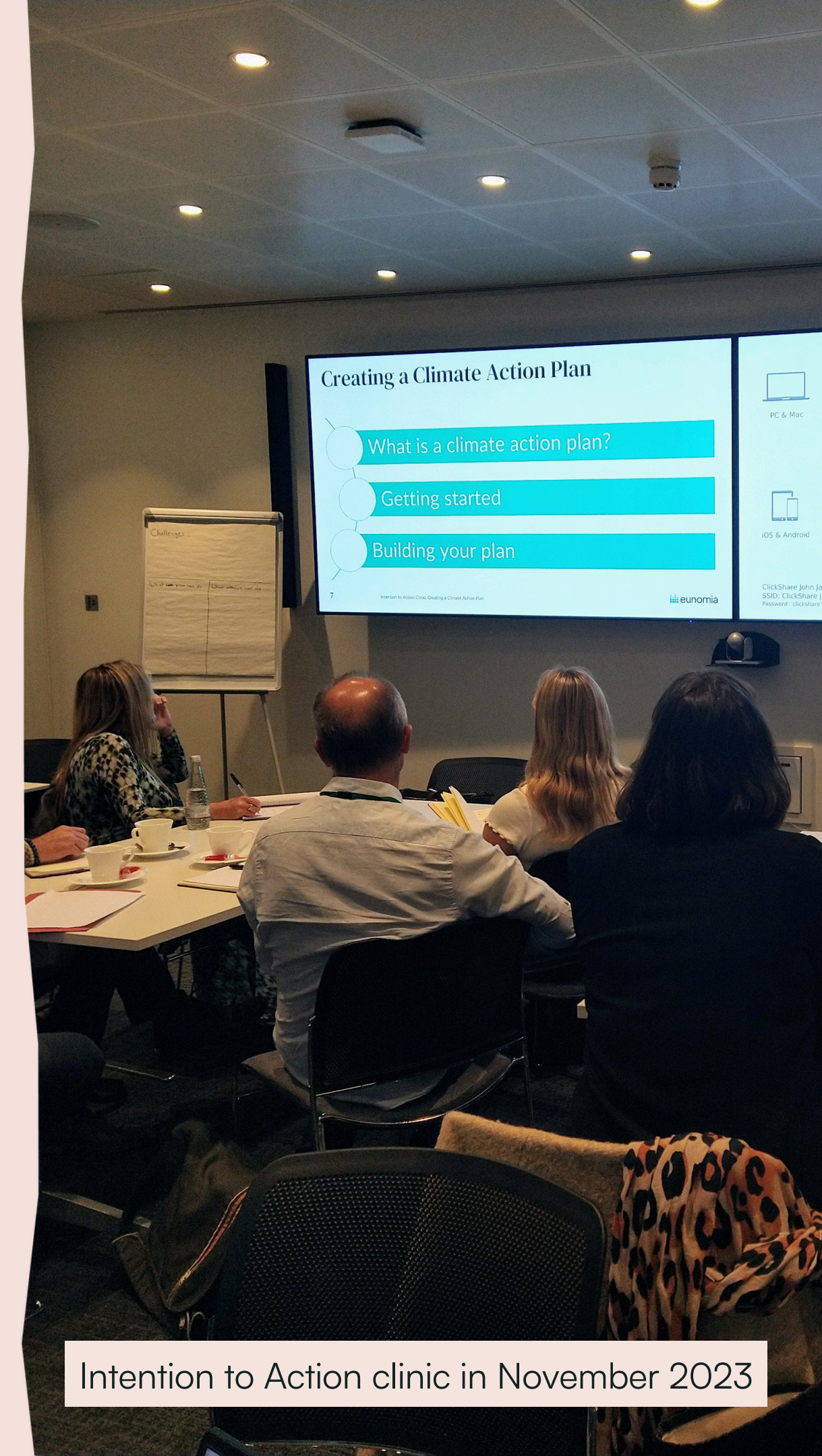
Intention to Action clinic in November 2023