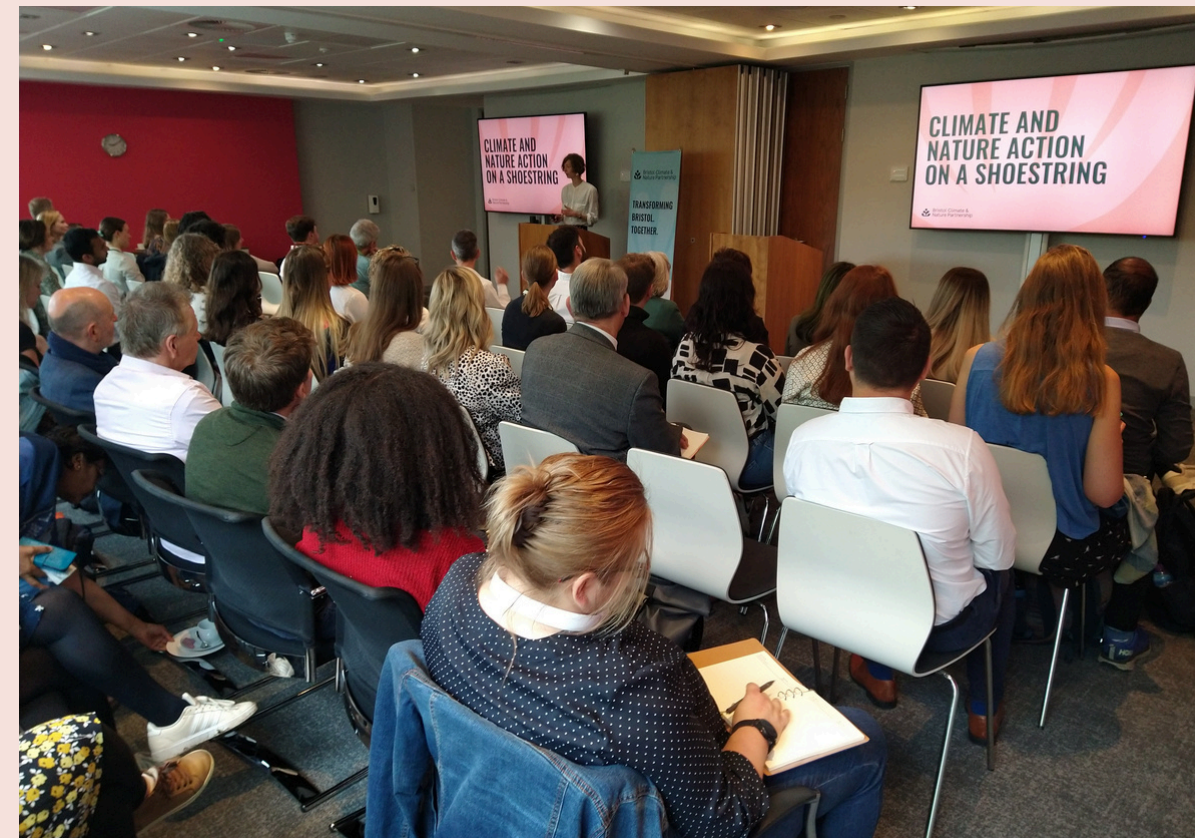
Climate Action Breakfast in May 2024