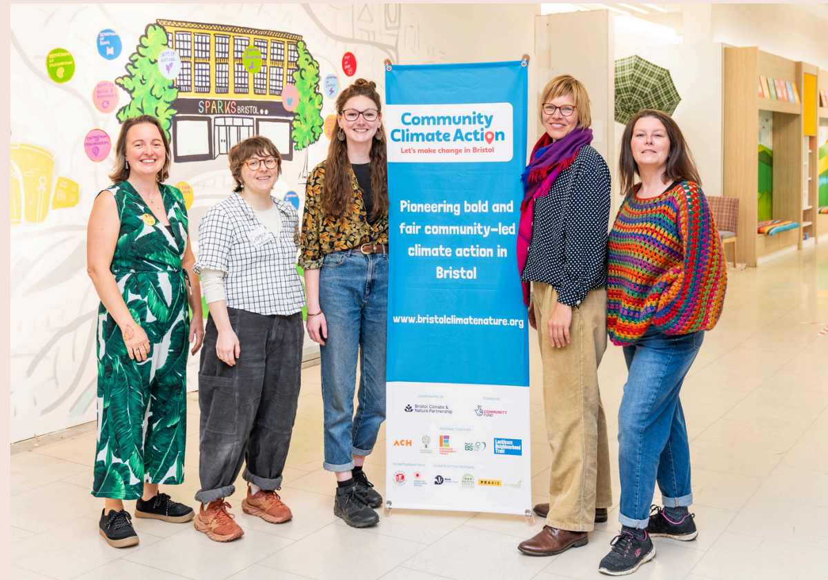
Cohort 2 Climate Action Plans launch in April 2024