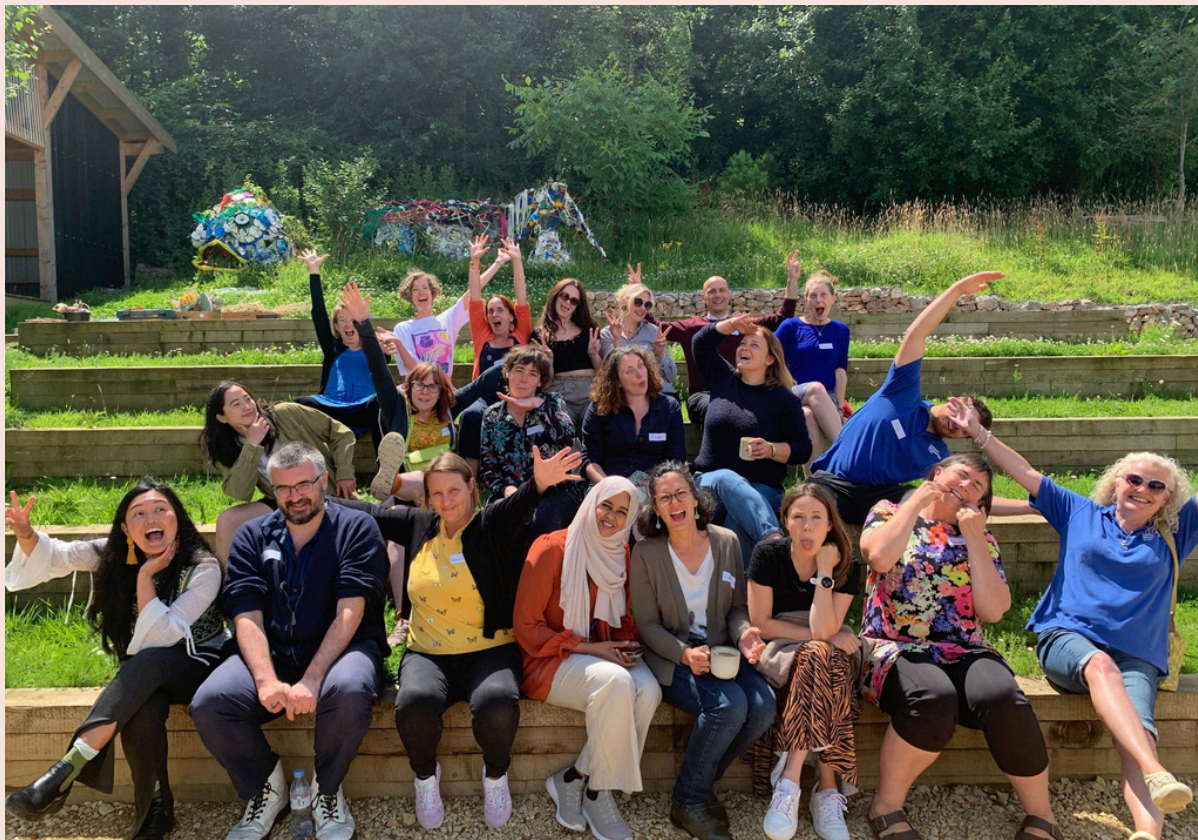
Cohort 1 Partner Forum July 2023

Five new communities developed and launched their community climate action plans, and we welcomed Bristol Older People's Forum, Gloucestershire Country Cricket Club (and the Next Test), Cliftonwood and Hotwells Community Association, One Green Kitchen, Rising Arts Agency and the Shirehampton Community Action Forum to the learning and mentoring programme.