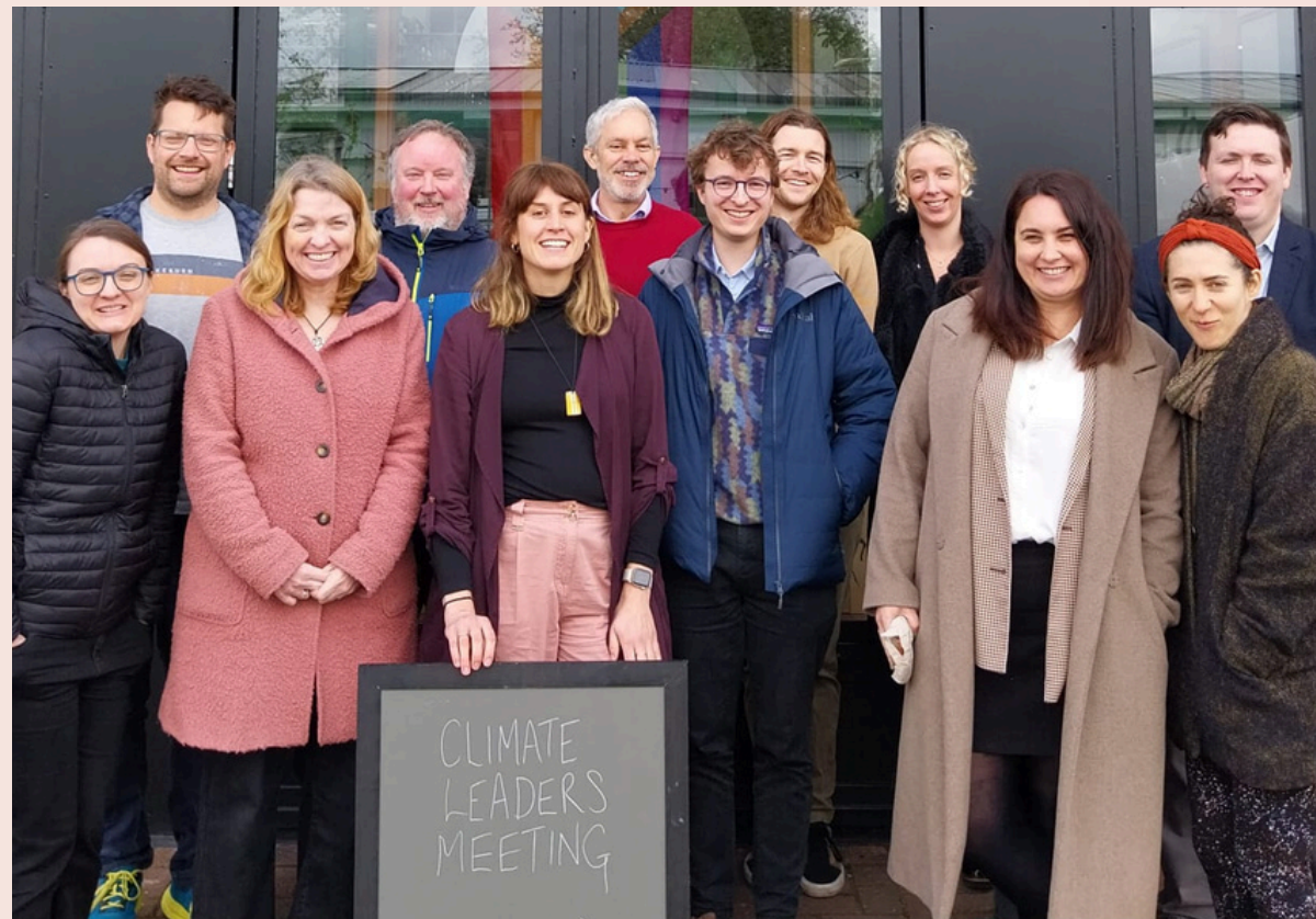
Climate Leaders Meeting in March 2024