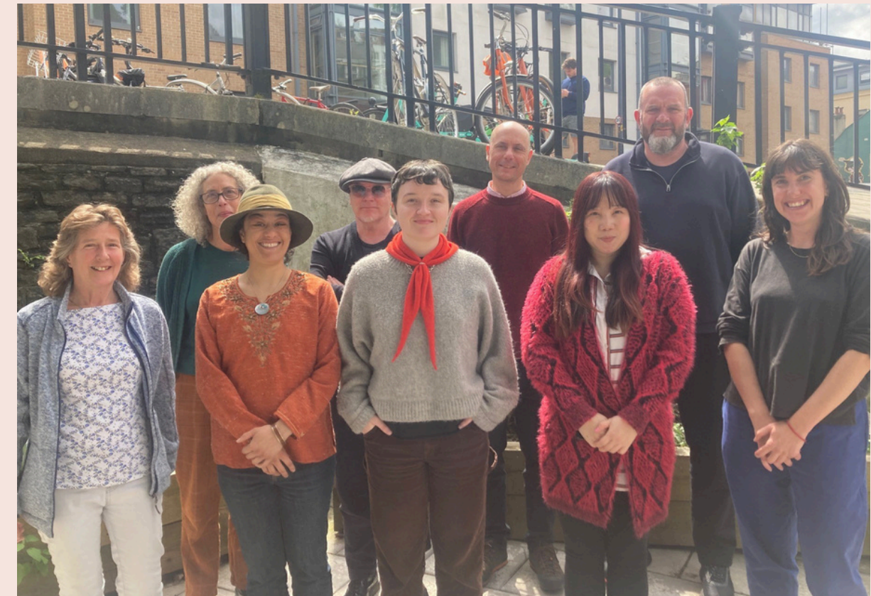
Cohort 3 first meeting in May 2024