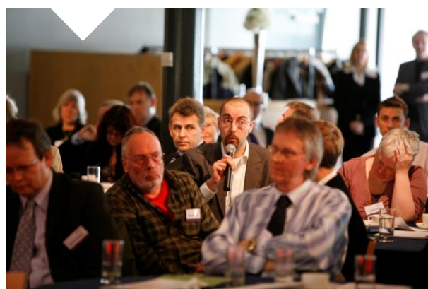
BGCP launch event, March 2007

The council funded the position of Green Capital Coordinator/Manager but the intention was always that it would have an independent leadership, identity and remit.