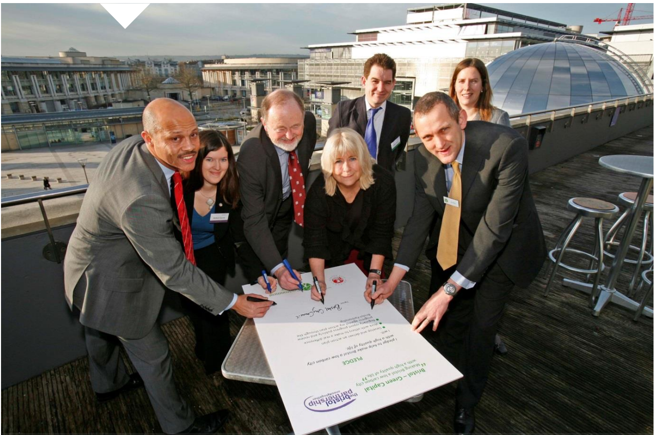
The first Members of the BGCP take the pledge

However, as a sustainability manager from another UK city council once said "you can't just invent a Partnership". That's largely true. Some of the BGCP's leading figures were gathering as far back as 2006 to agitate for change. The precise genesis of the BGCP is