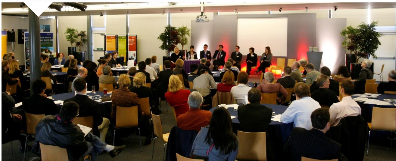
First Meeting of the Momentum Group 2007

The Action Groups continue to be hosted by elected individuals from member organisations, and together form an Advisory Group for the partnership, representing the wider partnership membership.